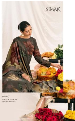
8049-C Dress in the picture is made of 100% cotton