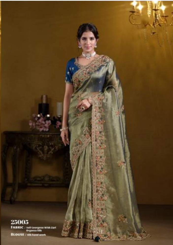
25005 FABRIC : self Georgette With Zari Organza Silk BLOUSE : silk hand work