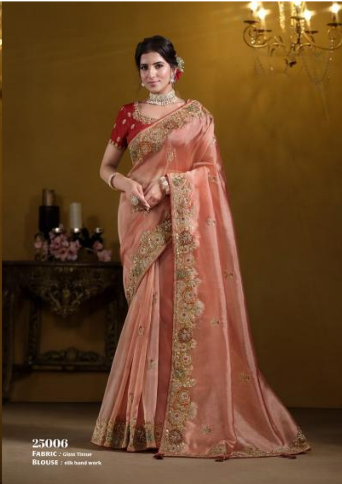
25006 FABRIC : Glass Tissue BLOUSE : silk hand work