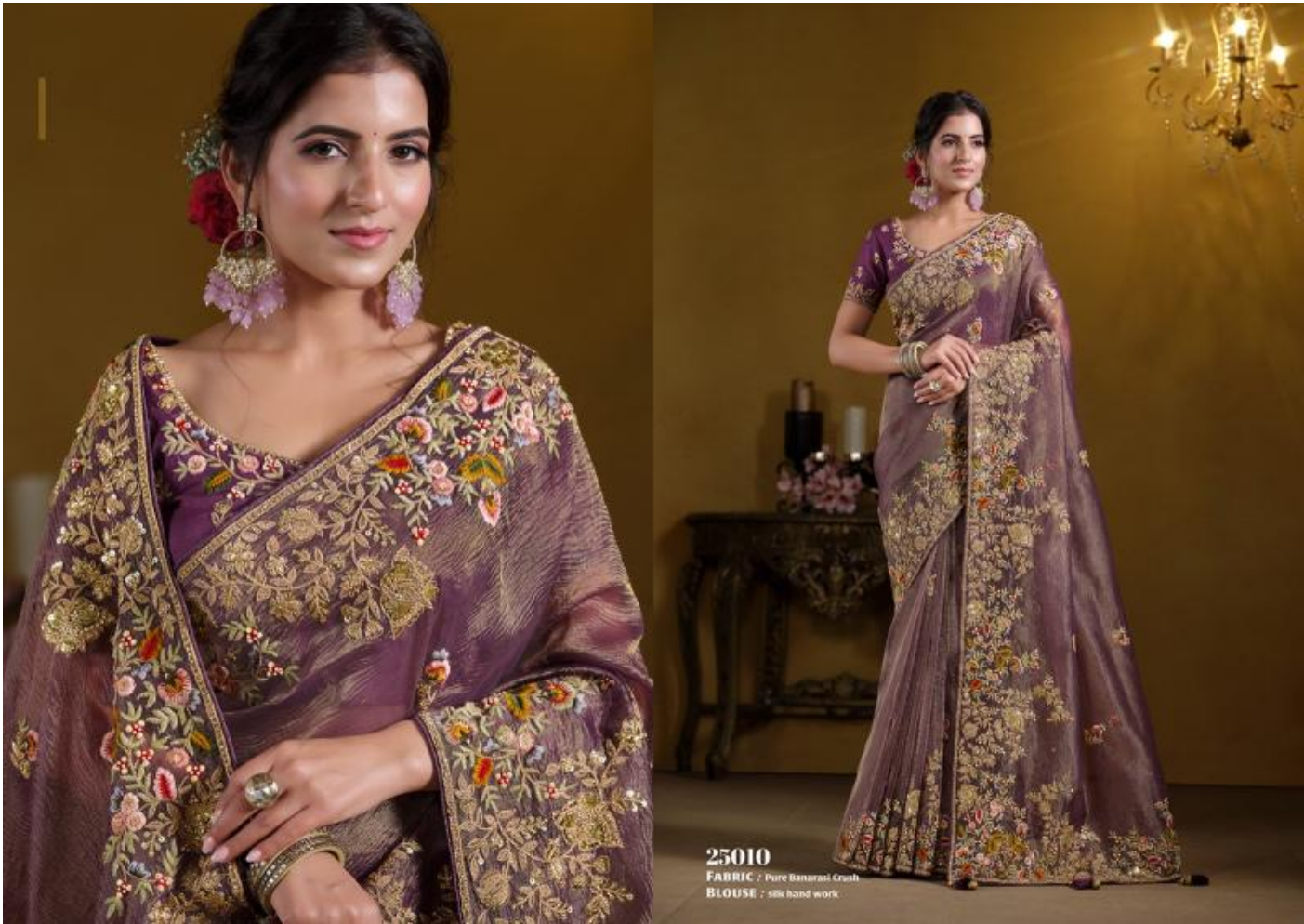
25010 FABRIC : Pure Banarasi Crush BLOUSE : silk hand work