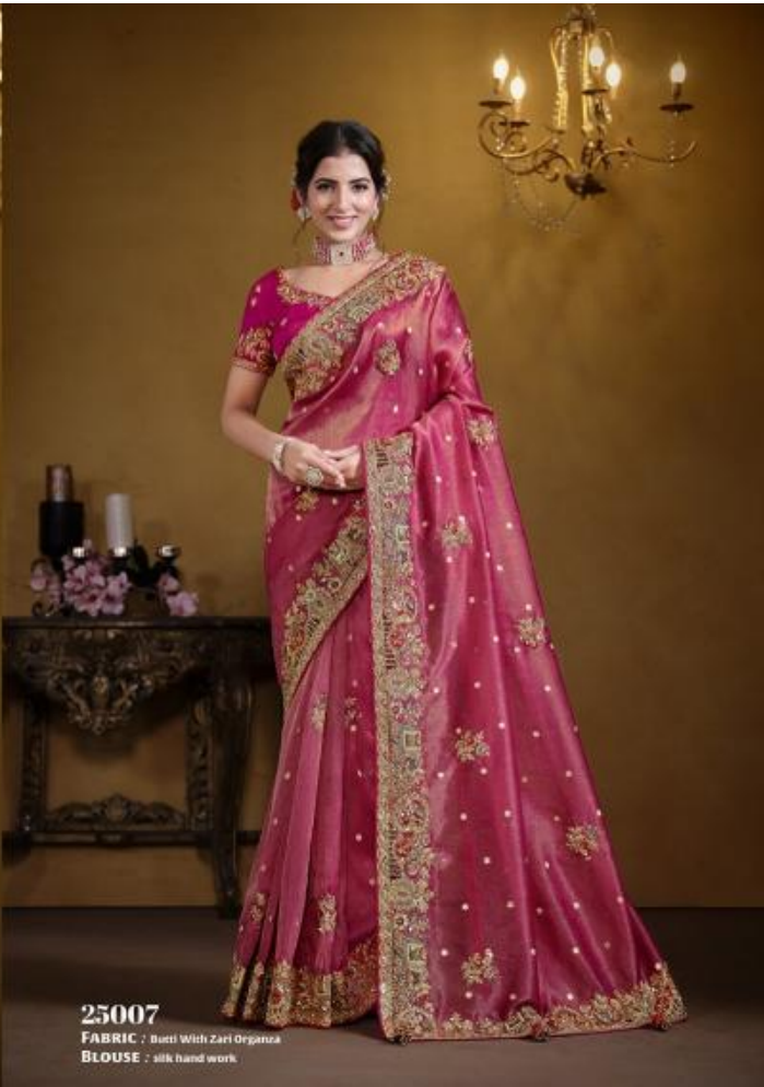
25007 FABRIC : Iueti With Zari Orpazna BLOUSE : silk hand work