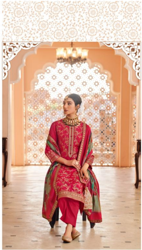
The collection sensuously creates an ambience of style & grace embellished immaculately with fine work