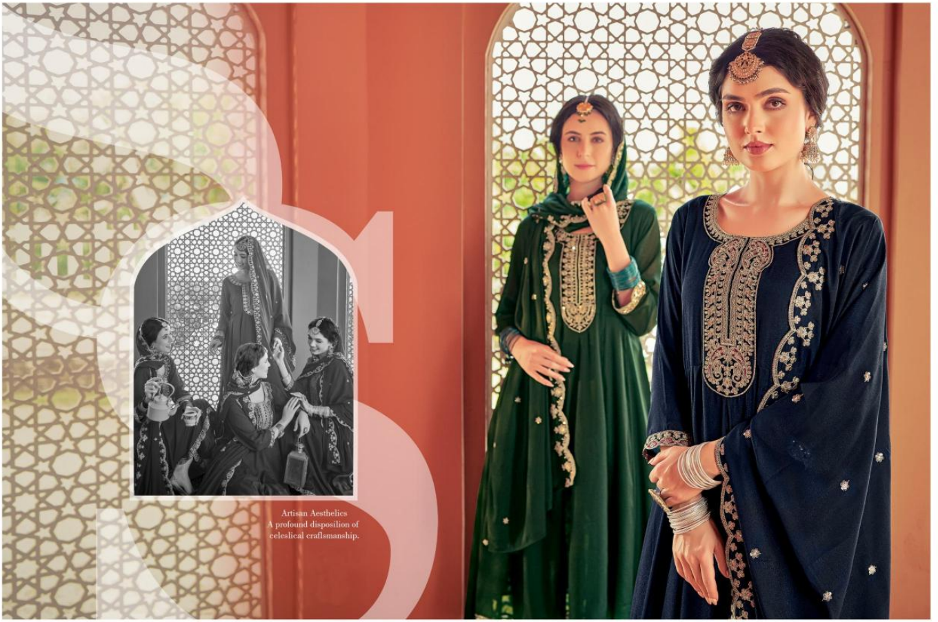
Artisan Aesthetics A profound disposition of celestial craftsmanship.