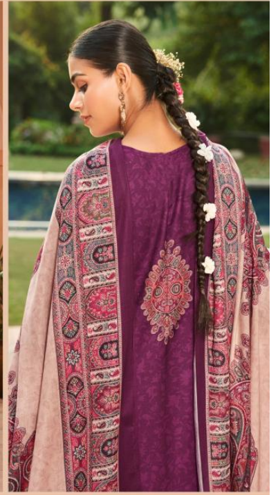
"The flavor of subtle ethnic wear that meets the contemporary glamorously explodes with minute details of elegance."