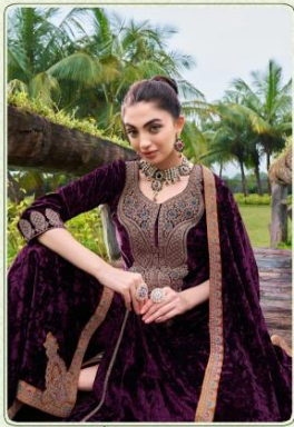
visage of enamour

It's all the things you love and all the things you hate in the world that make you who you are. It's the things you love and all the things you hate in the world that make you who you are. It's the things you love and all the things you hate in the world that make you who you are.