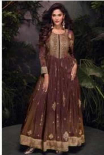
D NO : 5722