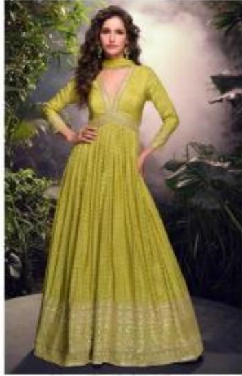
D NO : 5720