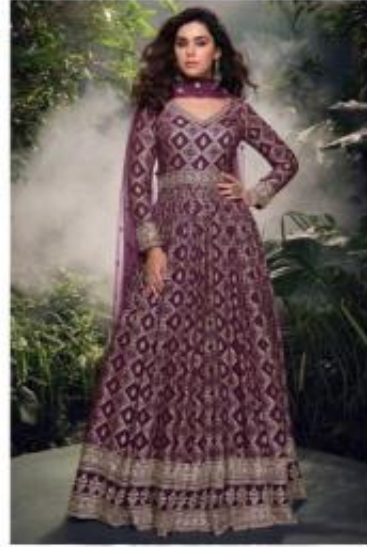
D NO : 5721