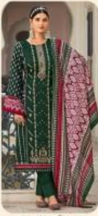
Bin Saeed/ 20003