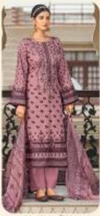
Bin Saeed/ 20001