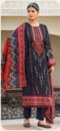
Bin Saeed/ 20006