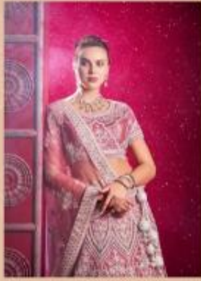
Creating your look with the latest in fashion Elegance