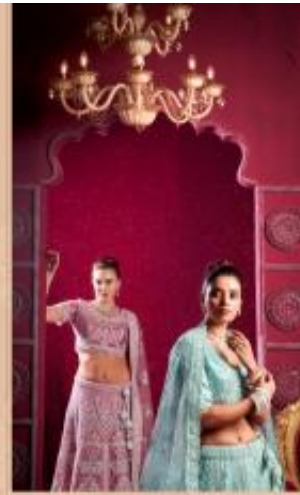
1. Design your lehenga from our new collection