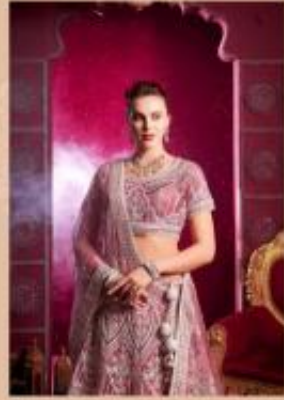
© 2014 Anantesh Lifestyle Pvt. Ltd. All Rights Reserved. Dress: 9817