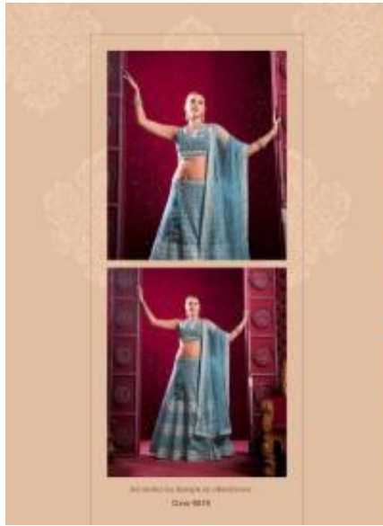
Set number 04, Range 04, 04-04-04-04 Code: 0479