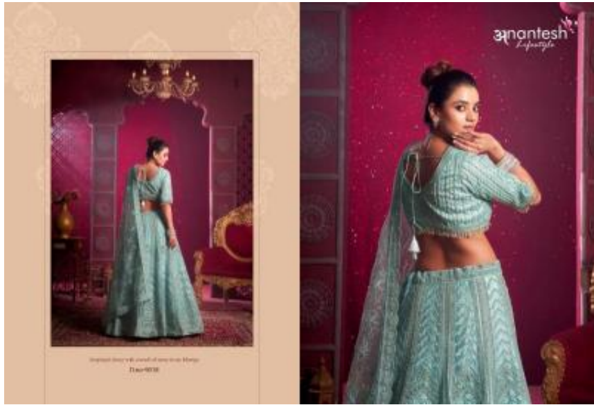
Designer: Anantesh Lifestyle Price: ₹12,999