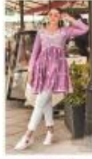
D NO:- 417