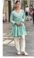
D NO:- 421