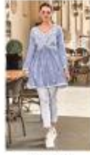
D NO:- 418