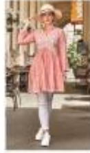
D NO:- 420