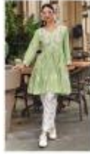
D NO:- 419