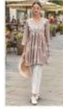
D NO:- 422