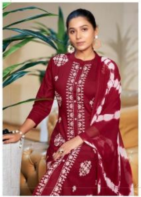
D no-1004 —