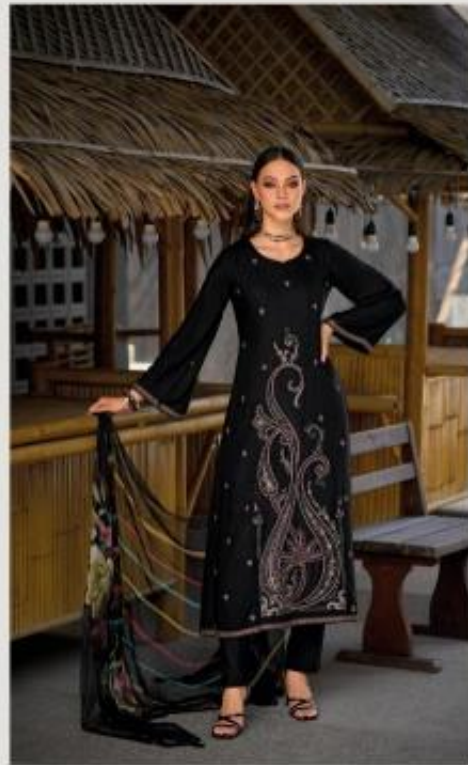
STRESS DOESN'T REALLY GO WITH MY OUTFIT