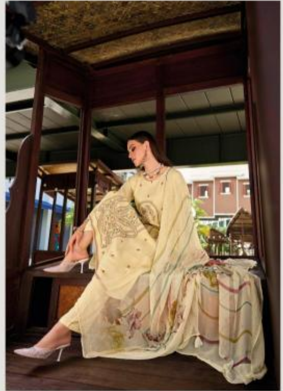
PLAYING DRESS-UP BEGINS AT AGE FIVE AND NEVER TRULY ENDS