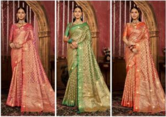
CODE| 1001 |