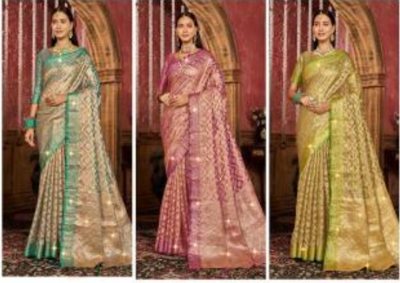
CODE| 1004 |