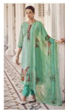
D No / 38004