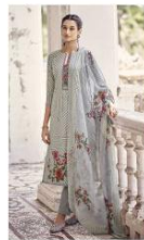
D No / 38002