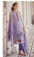
D No / 38006