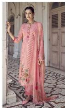
D No / 38001