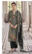
D No / 38005