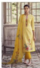
D No / 38003