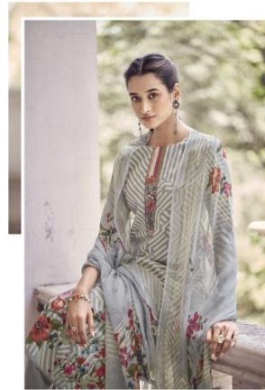
karachi D No / 1002