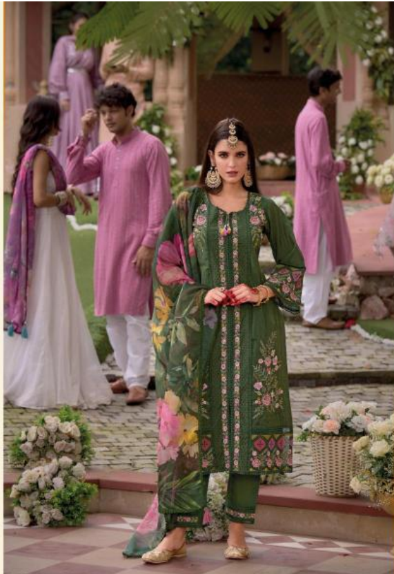
42752. The best color in the whole world is the one that looks good on you