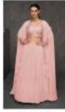
↔ 609-B ↔