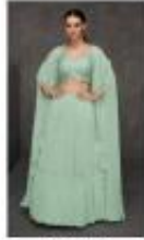
↔ 609-C ↔