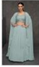
↔ 609-A ↔