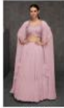
↔ 609-D ↔