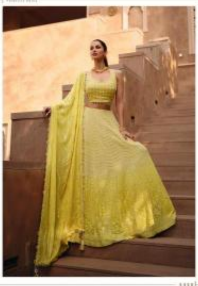
The fabric is lightweight and flowing, and the color is a vibrant yellow that is perfect for the season.