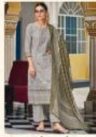
← CODE 4 2003 →