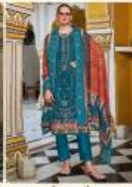
← CODE 4 2004 →