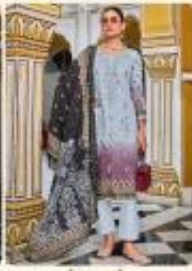
← CODE 4 2002 →