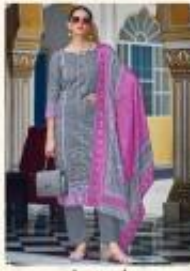
← CODE 4 2001 →