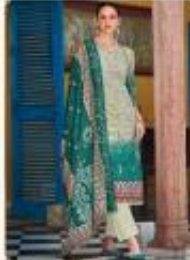
← CODE 4 2005 →