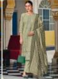
← CODE 4 2008 →