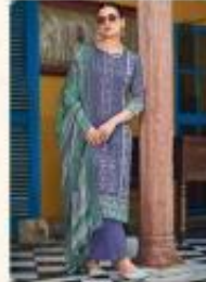
← CODE 4 2007 →