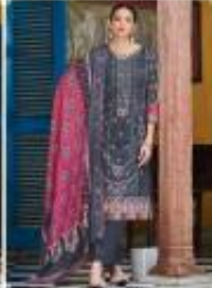
← CODE 4 2006 →