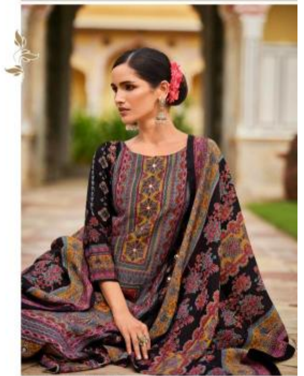
Bring your stunning look to meet the elegance of the season. Your evening into the season.