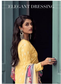
• The art of dressing elegant. • 18885