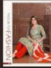
season of FASHION