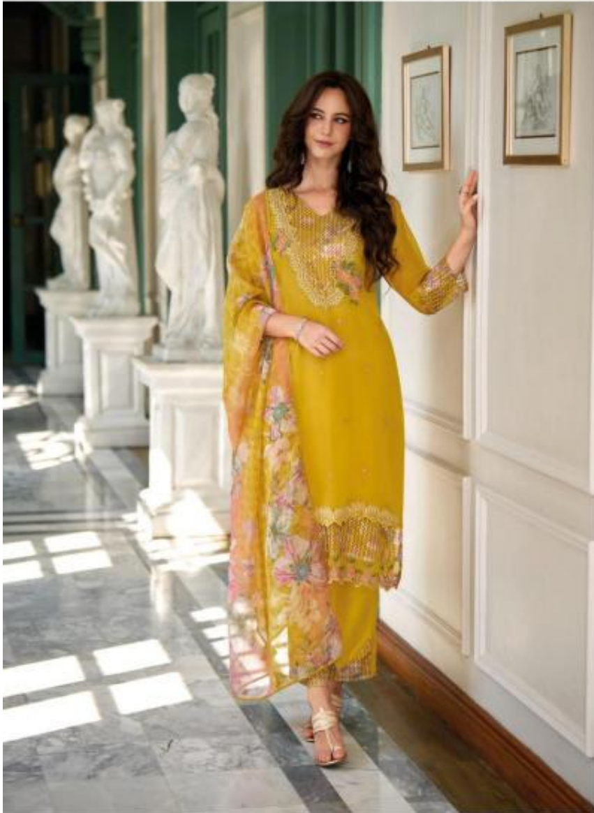
Her soul is a kaleidoscope bursting with every shade and have but shift your gaze ever so slightly and side's something entirely new.....