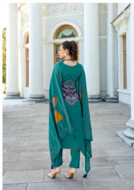
WHEN WE CHOSE TO TAKE INSPIRATION FROM INDIAN BEAUTY , THE RESULT IS HERE A SET OF VIVID COLORFUL DESIGN TO TELL A STORY ABOUT FASHION