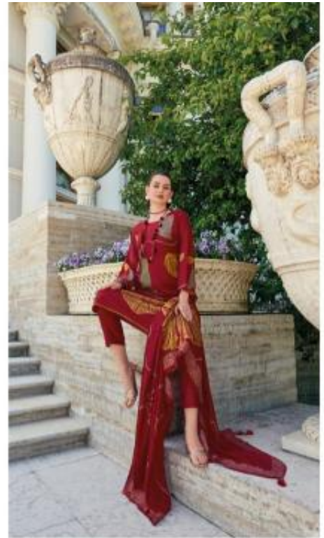
AN INSPIRATIONAL FABRICS UNDER THE DESIGNER PRINTED, IS TRULY TO BE MAHETRACKIONAL AND FOR WOMAN FROM ALL WALKS OF LIFE